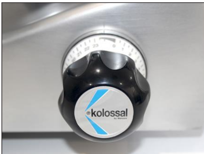
Precision slicing with the micrometric slice thickness knob.