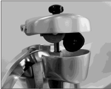
The built-in sharpener is simple and safe to operate.