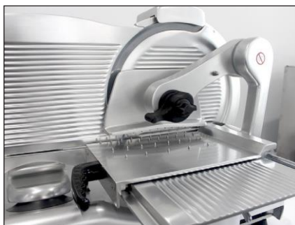
The generously sized meat tray can handle whole sides of bacon, and the smooth double-action movement reduces slicing effort.