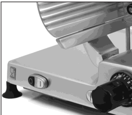
Moisture-proof, low-voltage micro-switches control the machine.