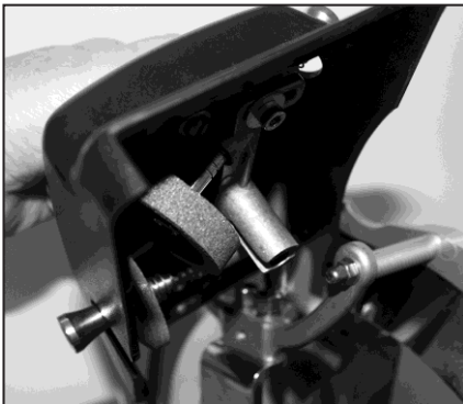
The integrated and removable sharpening device is simple and safe to operate.